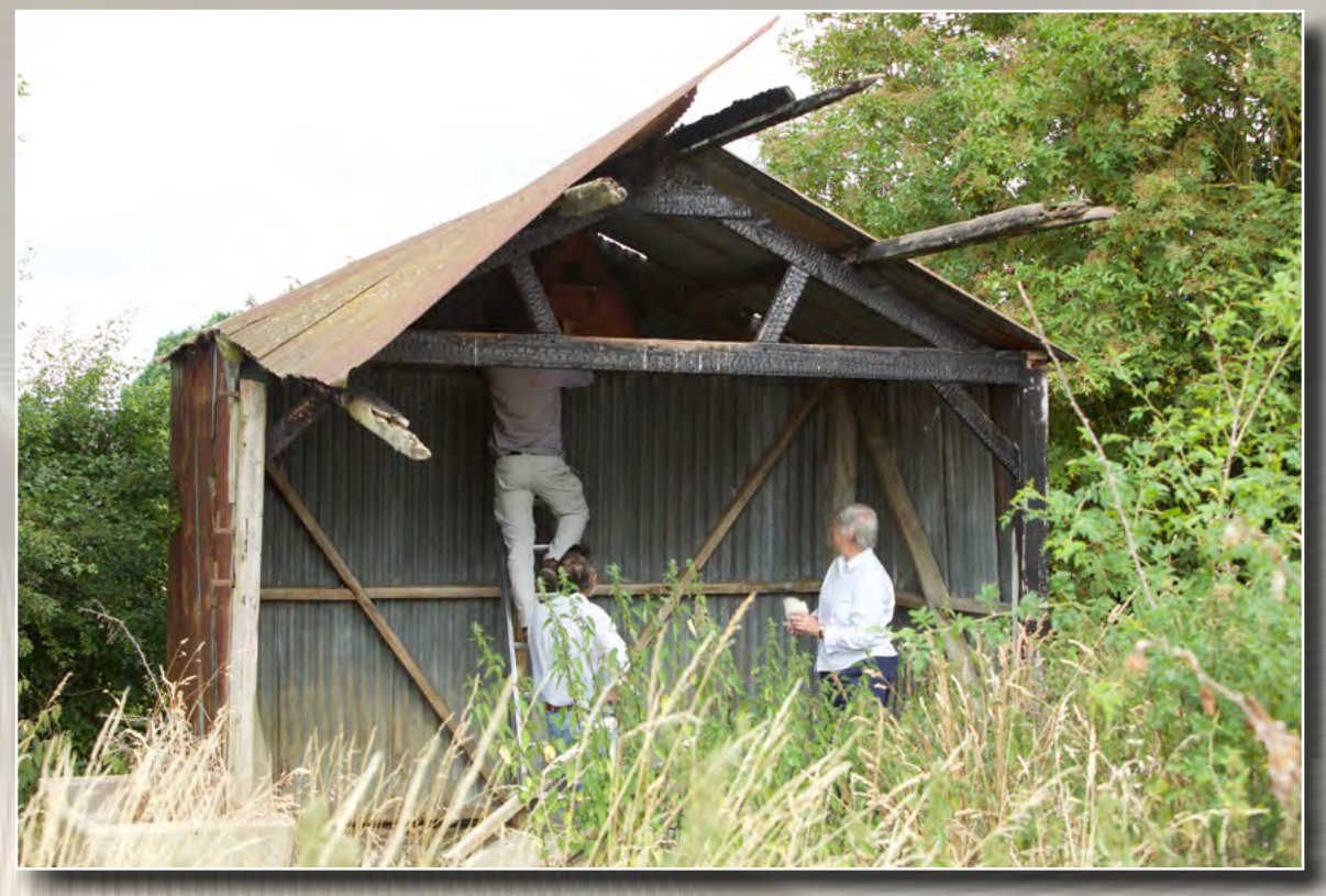
Monitoring a Barn Owl nestbox in the Stour Valley.

A below average year. It had huge potential for a good year. All pulli I ringed were very well fed. The extremely cold weather in early spring was to blame for the Barn Owls not reaching their potential breeding success.