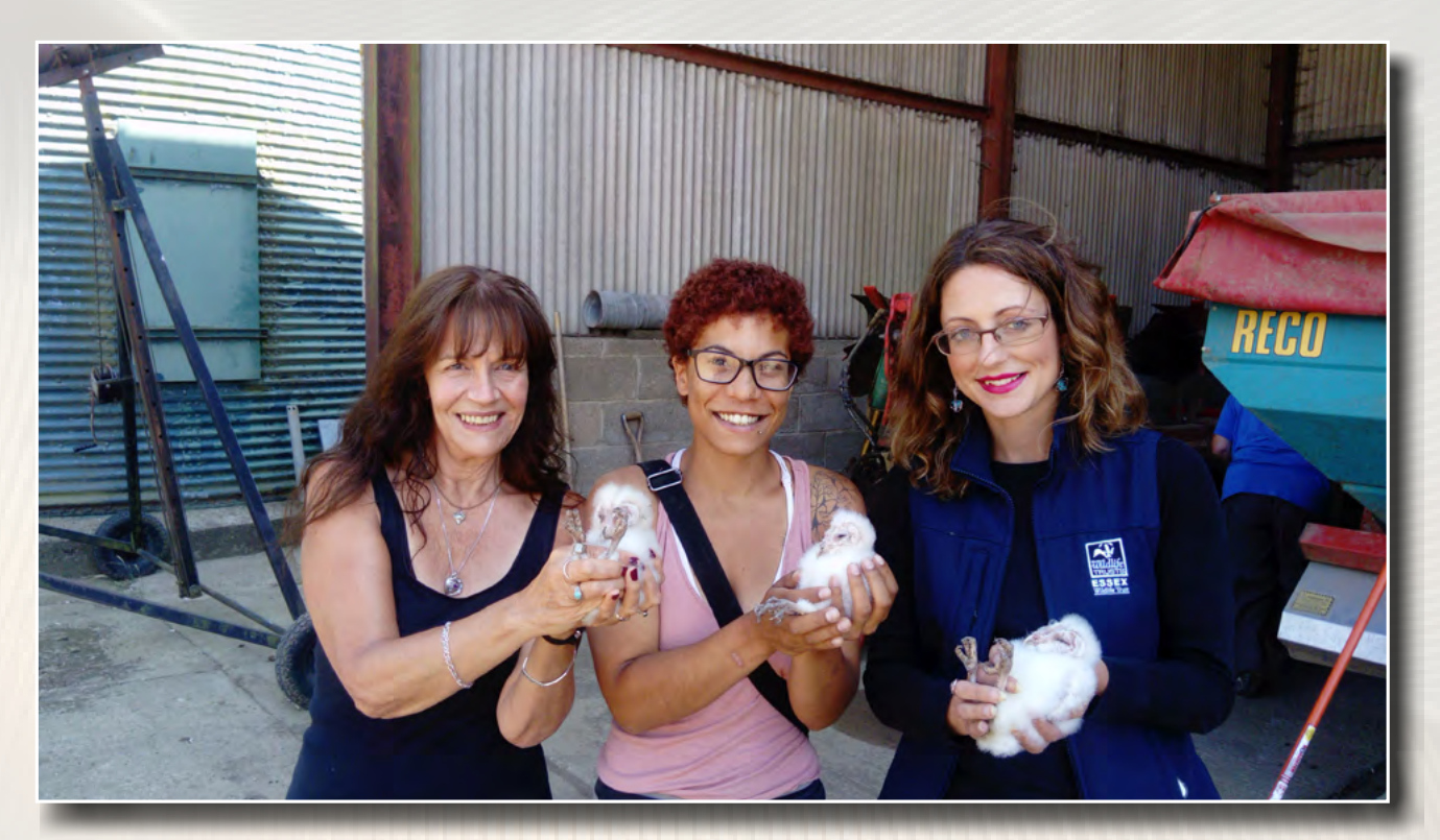
Volunteers with the Essex Barn Owl Conservation Project.

Although figures from Somerset (Andre Fournier, Cam Valley Wildlife Group) were almost exactly in line with their all-years-average, both for nesting occupancy and brood size, Andre reported "Nesting was about 4-5 weeks late as a result of the Beast from the East".