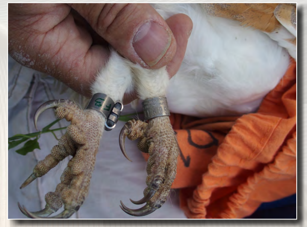
An adult Barn Owl fitted with a PIT tag, a passive device that is activated when it passes close to a reader.

Of most interest though were the large number of breeding first-year birds, which is also highlighted in the blog. Our presumption is that the cold late winter period really hit adults (even Cornwall had several days of snow